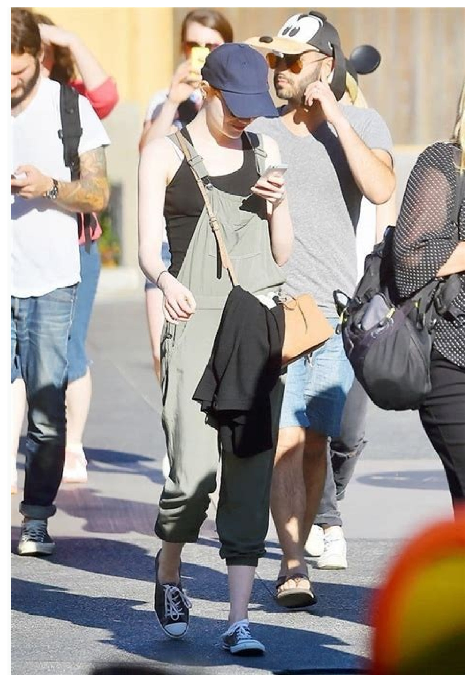
Disney appearance guidelines. Disney guidelines. Disney look requirements. Disney character guidelines.